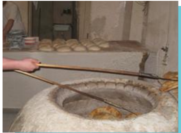
How to bake the Georgian bread?