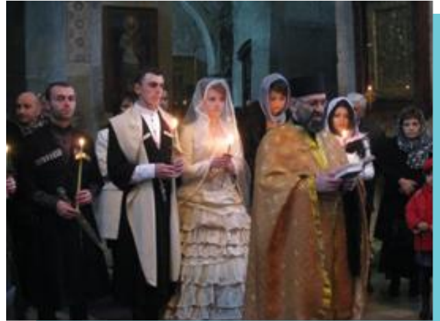
A traditional, orthodox marriage ceremony.