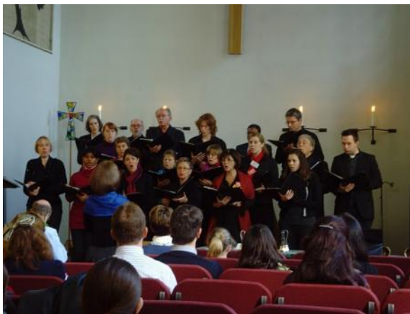
Regular Sunday worship services during autumn and winter months included anthems sung by Trinity's Sanctuary Choir to the glory of God.

Trinity is the host church for The Messiah Project. This oratorio will be performed in its entirety in English on Pentecost Sunday, June 12, 2011 in Frankfurt's Heilig Geist Church. The Project choir had a full schedule of Thursday evening practice sessions in October and