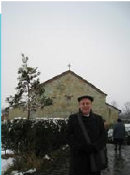
Pastor in front of the church of Trinity's sister congregation.