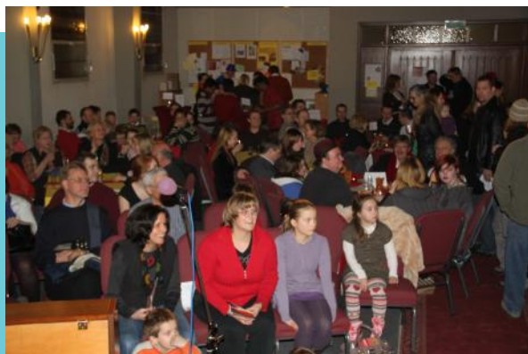
The audience anxiously awaits the next act during "Trinity's Got Talent", a fund raiser to help underwrite the costs of The Messiah Project.