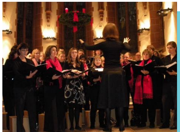
One of Trinity's traditional performances each year is in the Alte Nikolai Church on the third weekend of Advent.