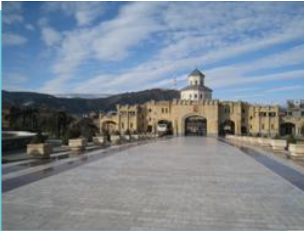
The weather made it possible to take a few pictures of the beautiful surroundings.