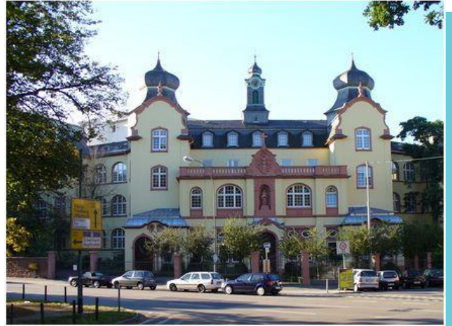
The oldest part of the Bürgerhospital, on the opposite side of Nibelungenallee.