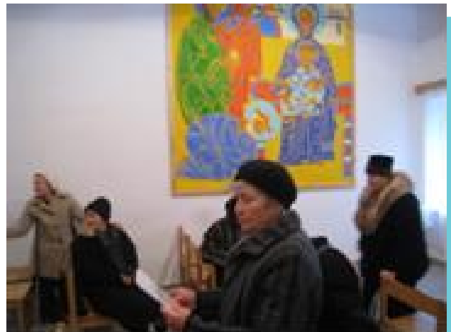
Interior of the church.